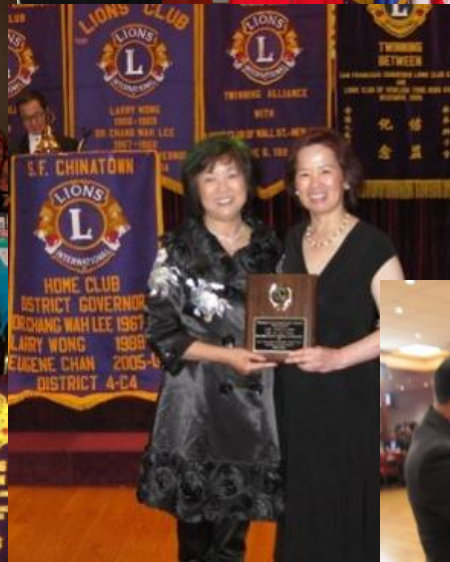
SF Castro and SF Chinatown Pictures