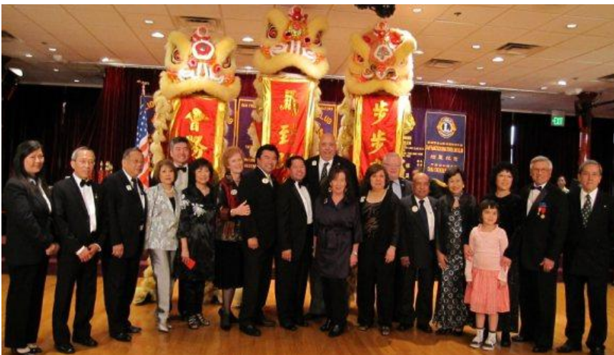
Chinatown Lions and Leos Installation Dinner