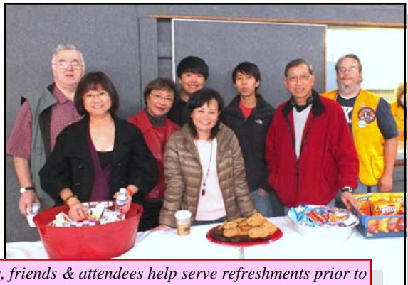
San Mateo Lions, friends & attendees help serve refreshments prior to the special movie night at the Mid Peninsula Boys and Girls Club.