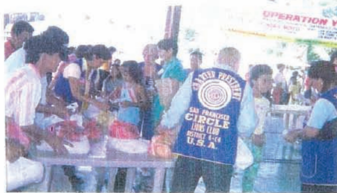
distributing grocery packages