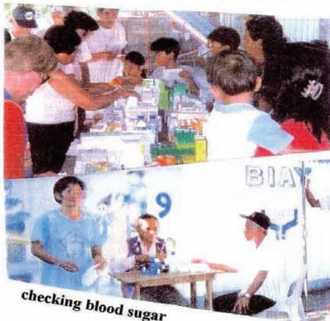
checking blood sugar