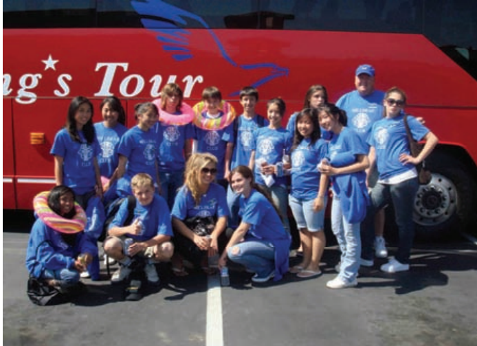
Millbrae Leo's Attend Convention