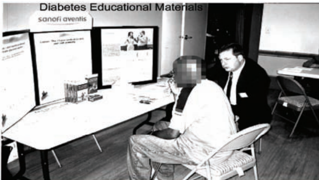
Diabetes Educational Materials sanofi aventis