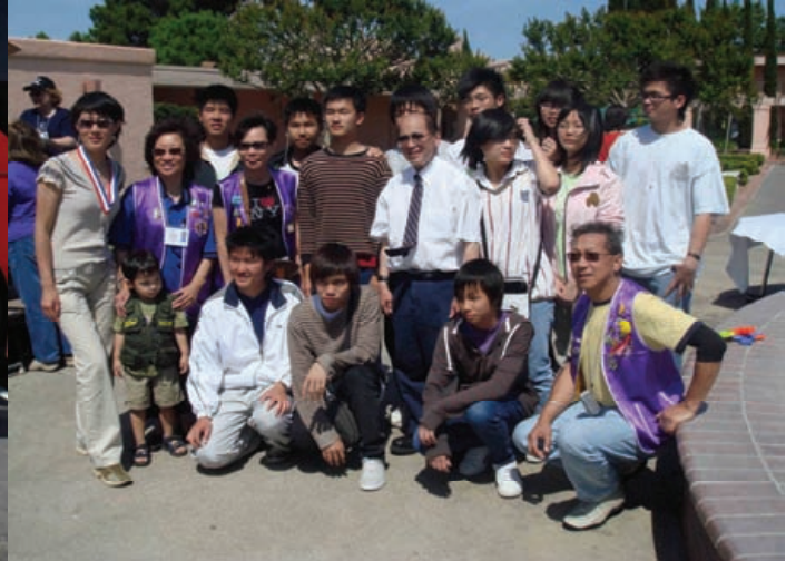
Chinatown Leo's Attend Convention