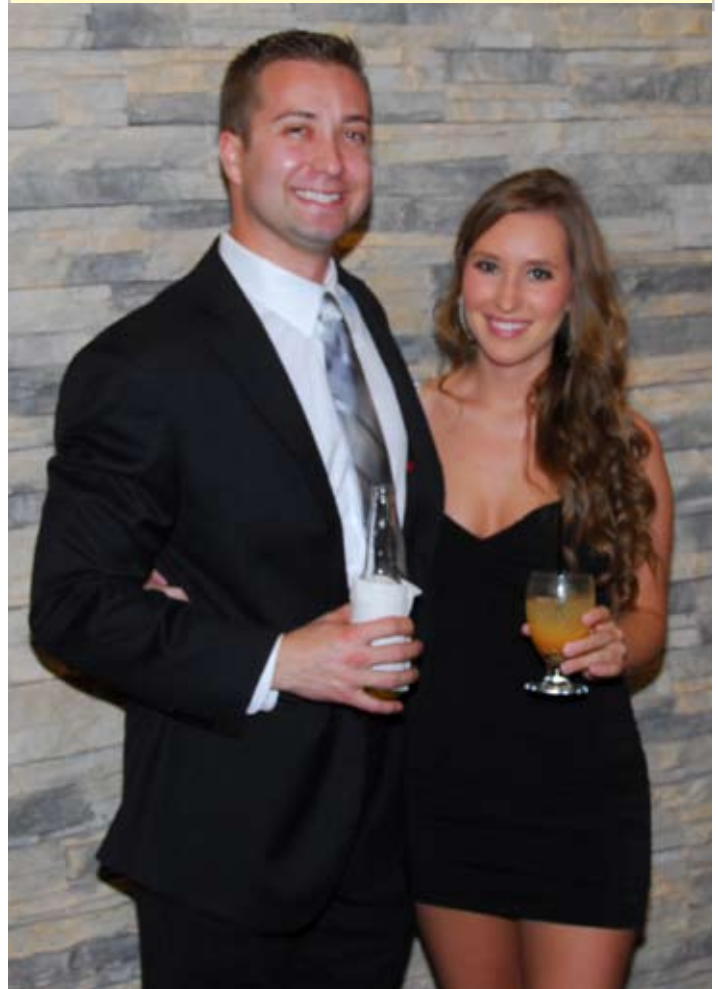
One very happy policeman and his girlfriend