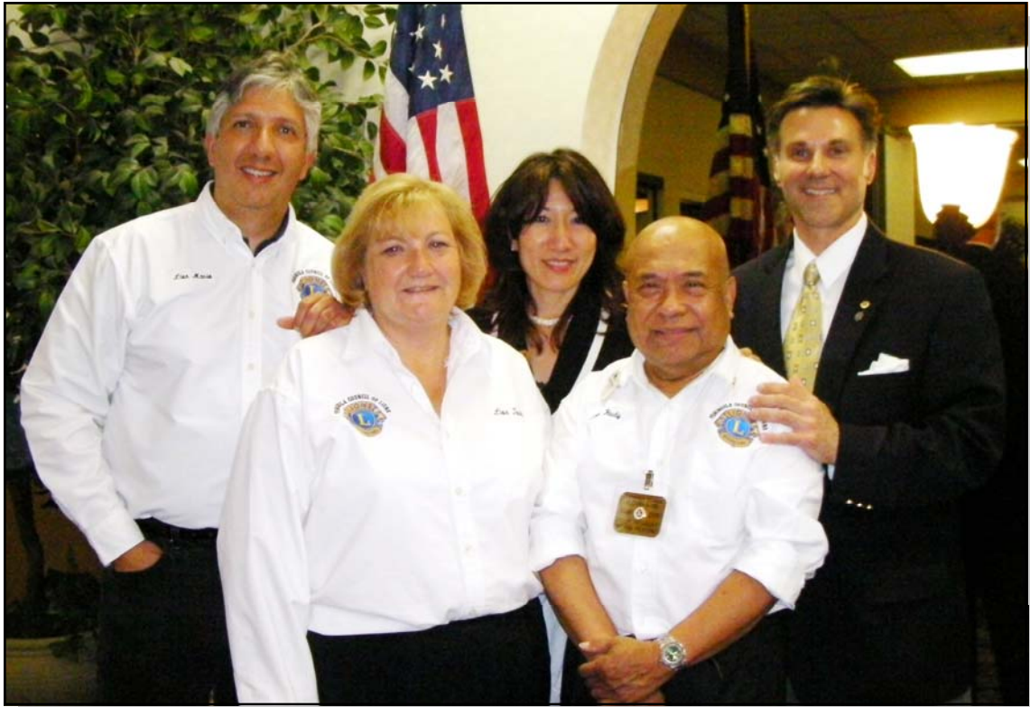
Photographed following the June 21st PCL meeting at the Grosvenor Hotel in South San Francisco. Pictured in order left to right below: