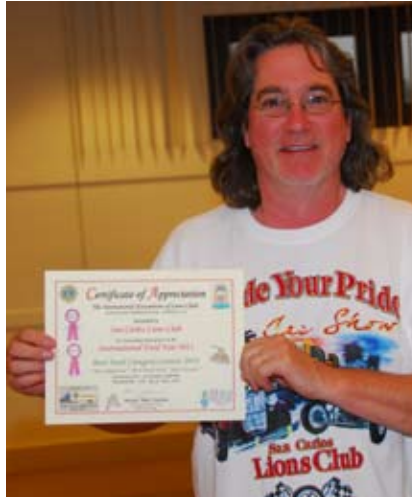
San Carlos received the 4th place award in the Main Dish category at the International Food Fair