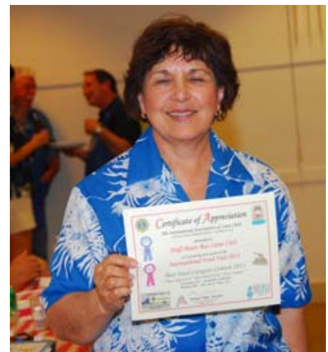
Half Moon Bay received the 3rd place award for the Best Desert at the International Food Fair