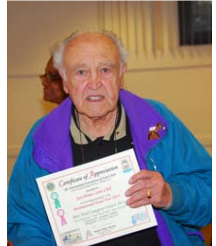
San Bruno received the 5th place award in the Main Dish category at the International Food Fair