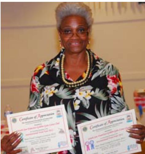
SSF Golden Gate received the 2nd place award in the Best Appetizer category at the International Food Fair