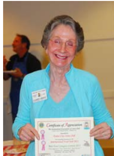
Foster City received the award for Best Food Category Appetizer at the International Food Fair