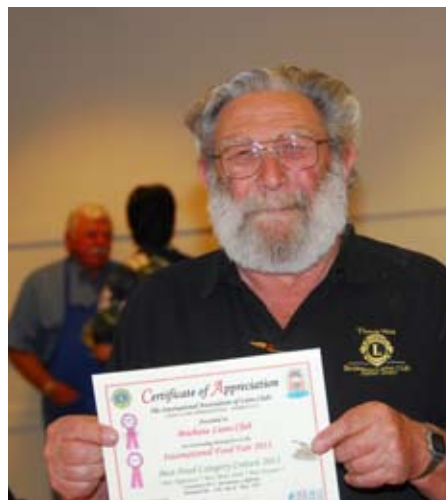
Brisbane received the 1st place award for Best Appetizer at the International Food Fair