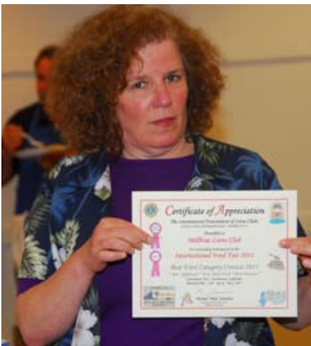
Millbrae received the award for Best Food Category at the International Food Fair