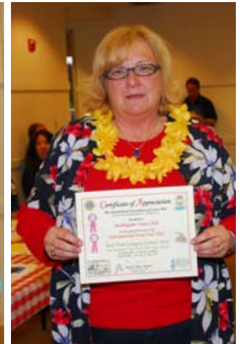
Burlingame received the 4th place award for Best Food Category Appetizer at the International Food Fair