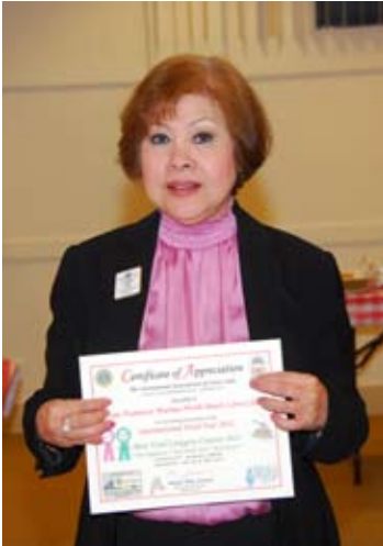
San Francisco Marina-North Beach received the 2nd place award in the Main Dish category at the International Food Fair