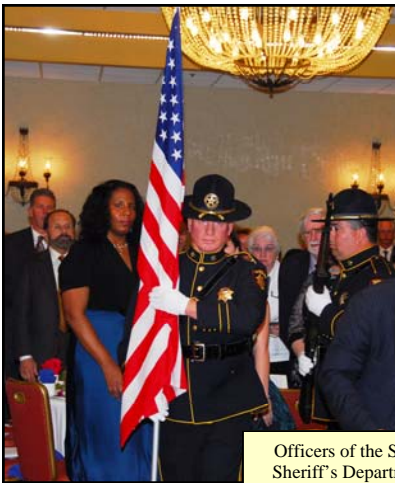
Officers of the San Mateo County Sheriff's Department Color Guard perform a ceremonial posting of colors.