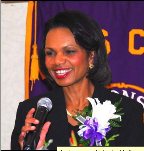
An attentive crowd listened as Ms. Rice spoke of her pride in our country and the Police & Firefighters that protect it.

Condoleezza Rice who was greeted with a standing ovation.