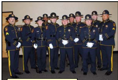
San Mateo County Sheriff's Color Guard officers gather in preparation for a special flag posting ceremony in honor of this special event.