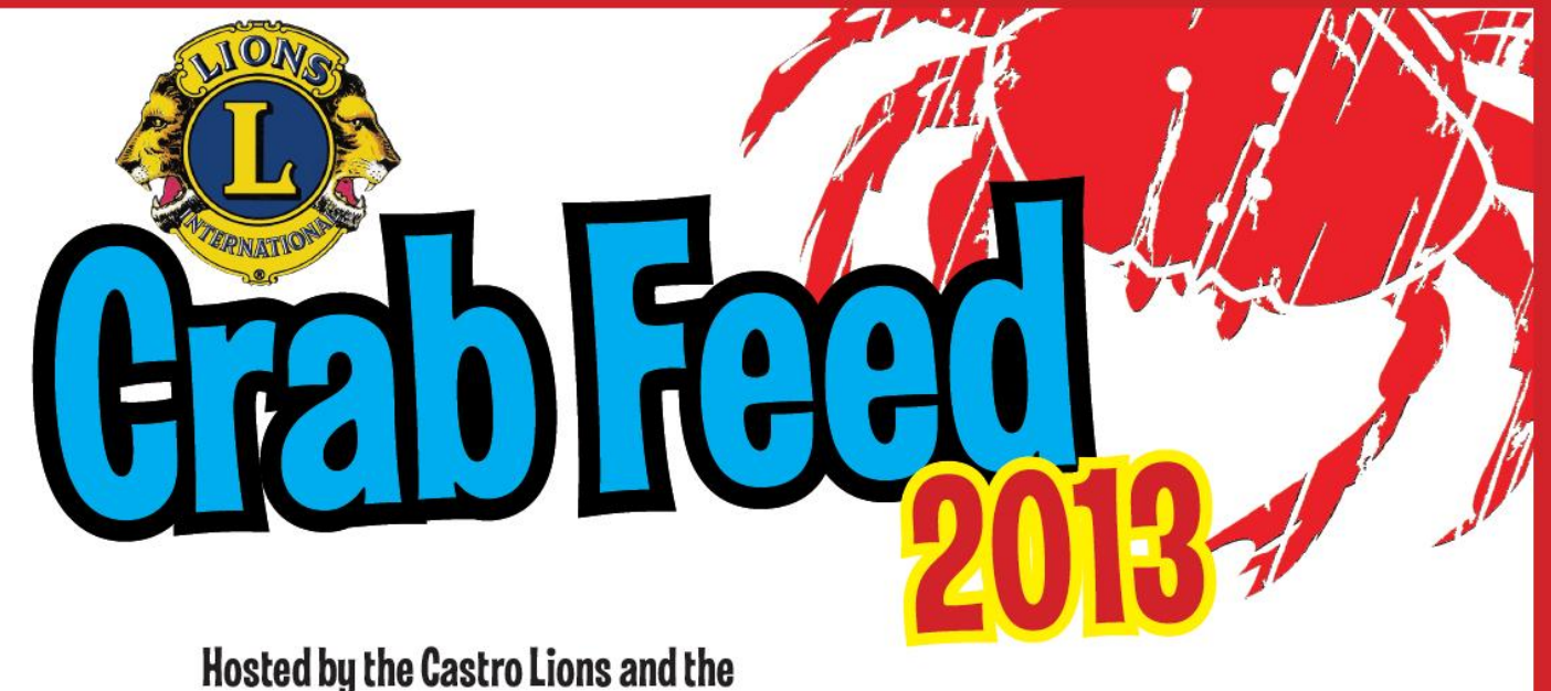
The Lions Tale Bulletin

Park Presidio Sunset Lions Club benefitting a host of charities including Lighthouse for the Blind, the AIDS and Breast Cancer Emergency Funds, and Guide Dogs for the Blind