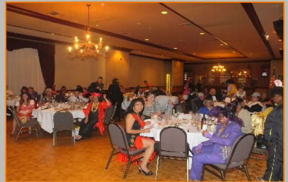
Halloween Party Attendees