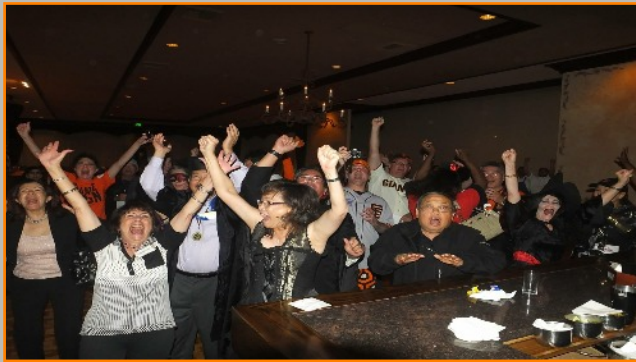
The Giants won the World Series- We all cheered!!