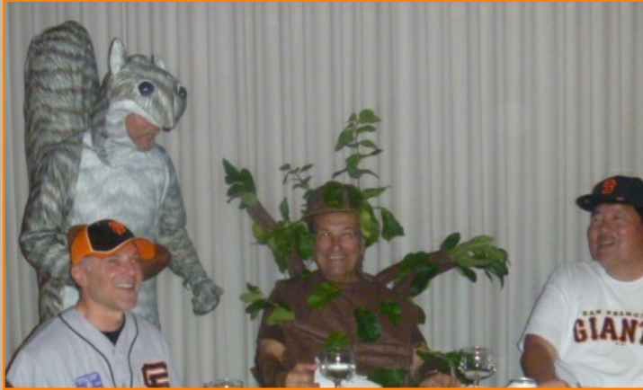
The “Pesky” Squirrel and “The Tree” and our very own “SF Giants”