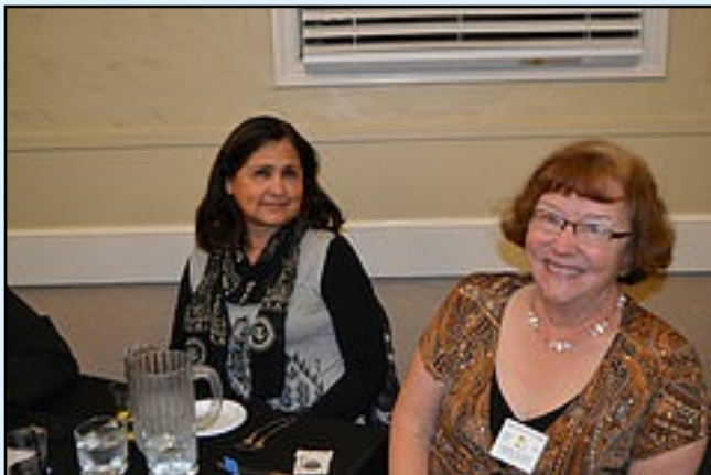
Foster City Lions