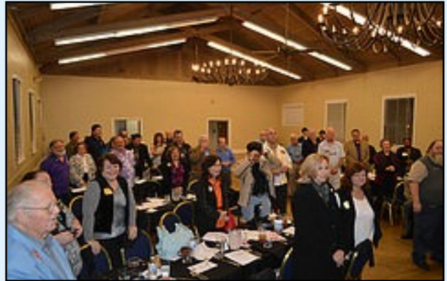
Bay Area Special Olympics Lions (Front Row)