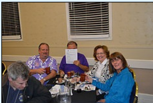
San Carlos Lions