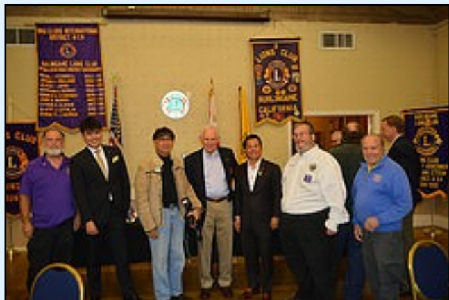
PCL Meeting Attendees