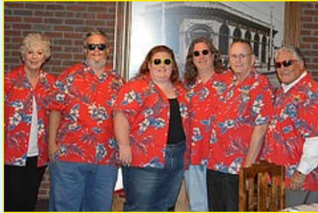
2015-2016 PCL Board of Directors