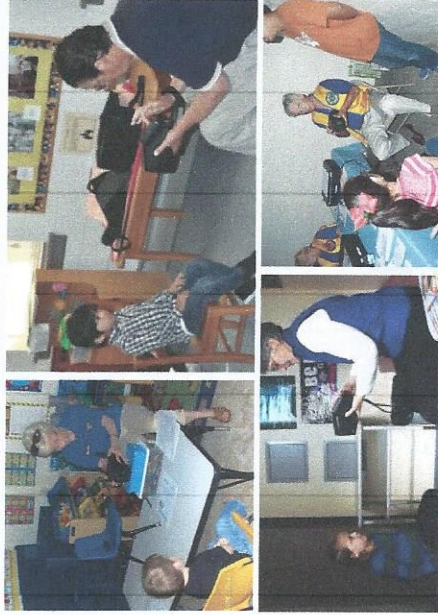
Lions Clubs provide vision screenings and many other services to their communities. What are your projects?